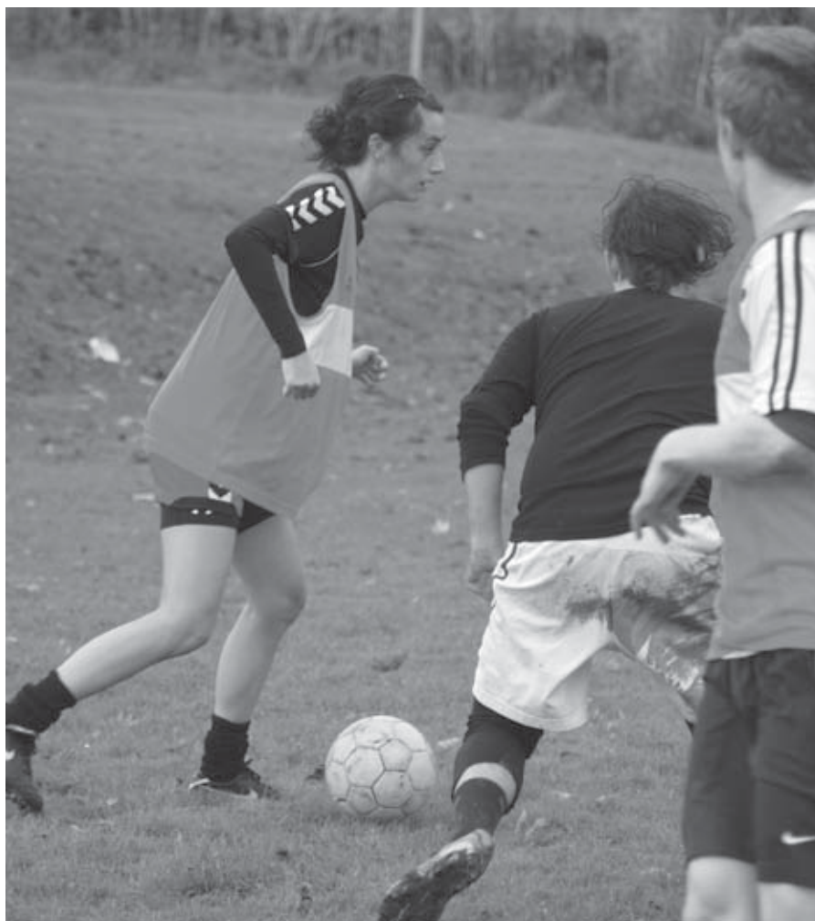
How could RU be made into a sporting Utopia?