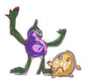
Figure 3. Detail from sequence that was vocalized by a 3year old, sketched by a 7 year old and finalized by the artist