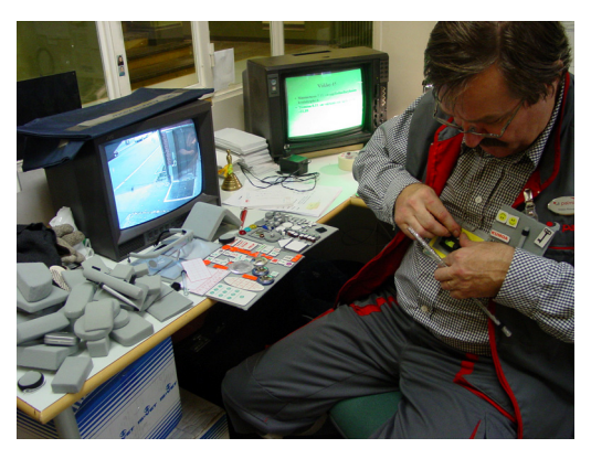
Figure 1. An ageing worker using make-tools to design a facilitator i.e. a digital device for improving his daily work.

To give ageing workers the possibility to actively participate in the design phase we combined generative make-tools (Sanders & Dandavate 1999) with six videoobservations. Make-tools are tangible design items which can be used to facilitate ideation and expression of needs (see Figure 1). The ageing workers were asked to create "a dream device" which could facilitate their tasks or wellbeing at work. They were asked to carry the dream device along during their normal activities, while we shadowed with the video camera. Now and then the observation was interrupted for a short reflection, when the worker either acted out or described how and why to use the dream device in context. The aim of the make-tools in context was to support ageing workers to imagine possible use situations and useful properties by utilizing the real context as a trigger and inspiration. In this way the ideas were bound to the real context, tasks and needs.