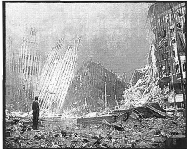
Figure 3. The devastated World Trade Centre.

The cursor is hidden as the viewer tries to uncover the layers of information and to propel the piece forward.