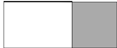
Figure 2. The square area and the side provided with a wāsītum .

A similar trick but a different word is used in TMS IX #1, [21] in which the length is added to a rectangular area, and it is explained that this corresponds to the joining of a “base 1” (KI.GUB.GUB 1) to the width – see Figure 3. A third trick, used in the text YBC 4714 #30–39, consists in introducing a “second” width of 25 in order give concrete meaning to the statement that the difference between the squares on the two sides of a rectangle is equal to 25 times the smaller of these sides.