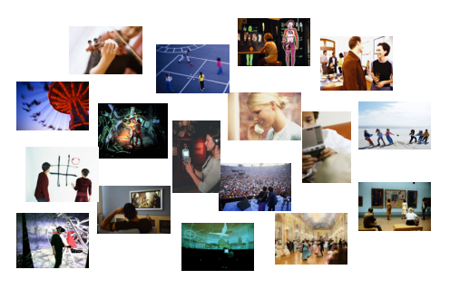
Fig. 2 Warm-up images presented in workshop 1

Participants were randomly assigned to teams to complete three out of four of these activities and to present their outputs to the other teams.