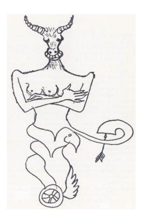
Fig. 1: The "cadavre exquis" from Eluard, Ray, Picasso, 1925)

One of the most interesting aspects of the installation is the continuous adaptation of the creatures to the language due to the accumulation of experience of visitor participation. Changing the context of the visitors, the creatures progressively replace the old words and semantic relations with the new instances. In this adaptation process, the creatures continuously reflect the language changes and the attitude of the visitors to respond to artificial personified entities.