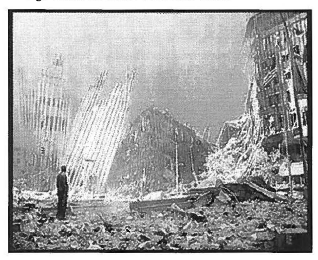
Figure 3.The devastated Word Trade Centre.

The cursor is hidden as the viewer tries to uncover the layers of information and to propel the piece forward.